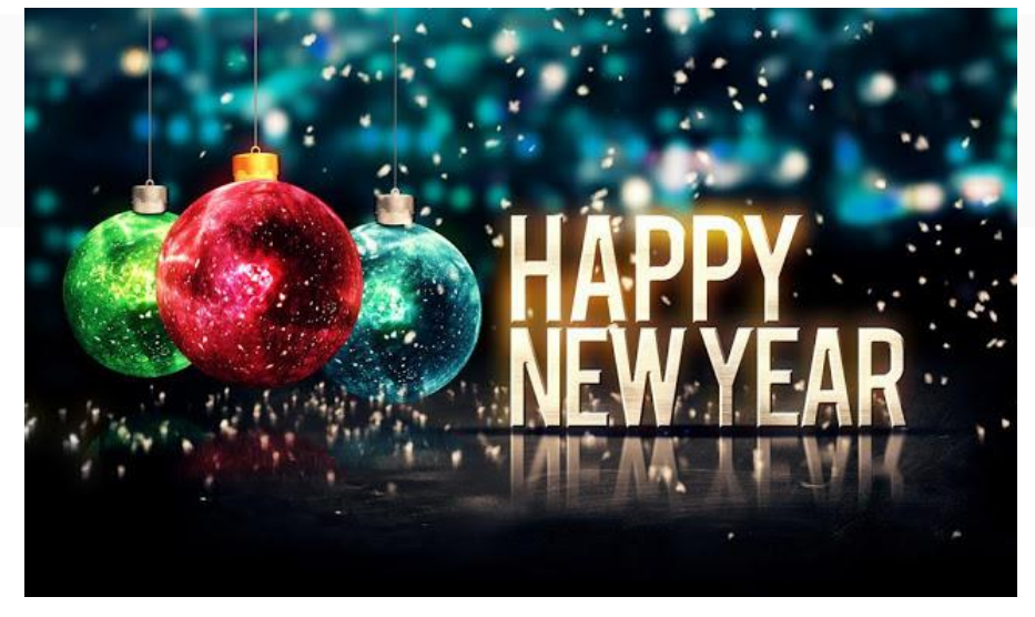
Wishing everyone a happy, healthy and joyful 2017!